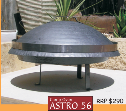
*Ideal for roasting meals traditional breads, bureks, etc...